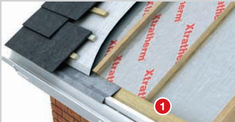
1. A timber stop rail is fixed to the bottom of the rafters

A treated timber stop rail, the same thickness as the Xtratherm Sarking Insulation, is fixed to the rafters close to the eaves to provide a firm fixing point for the counter battens. The Xtratherm Sarking boards are laid over the rafters commencing at the stop rail, the Tongued and Grooved edges of the boards should be fully engaged and positioned in a staggered pattern over the rafters. Repeat the procedure using crawling boards until the entire area from eaves to ridge has been covered. The insulation will not support operatives. Any gaps in the insulation (e.g. at the eaves, ridge, valleys and around any roof lights etc.) must be sealed with flexible sealant or expanding foam. Accredited Detailing must be followed. Use large headed clout nails to hold boards temporarily in place until they are secured by the counter battens.